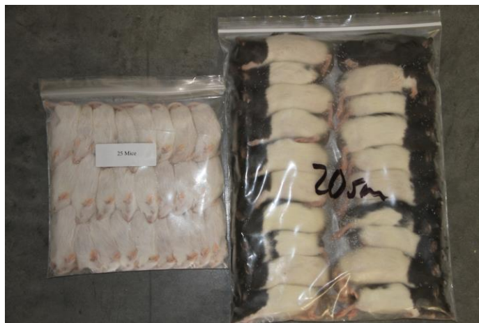
Frozen mice and rats, labeled and packaged for shipping.

Rodent offspring are removed for sale at various stages of life to accommodate the variety of reptiles being fed. Terminology and descriptions differ somewhat among producers, but the table below describes the general classes of feeder mice and rats. Feeder rodents are sold live or frozen; the majority of animals are frozen which simplifies transportation and avoids degradation in quality of live animals from transport stress. Neonates typically are frozen directly per standards of the American Veterinary Medical Association, while larger rodents are euthanized before freezing (AVMA 2013). Frozen rodents are bagged and shipped in quantity according to the size of the order. Live mice and rats are shipped in well ventilated, leak-proof containers with absorbent bedding. Water and food are provided for animals in transit for more than six hours.